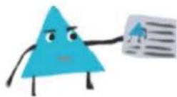
Drivers license/State ID

Call Housing Access for Washtenaw County (734-961-1999) and have these documents ready: