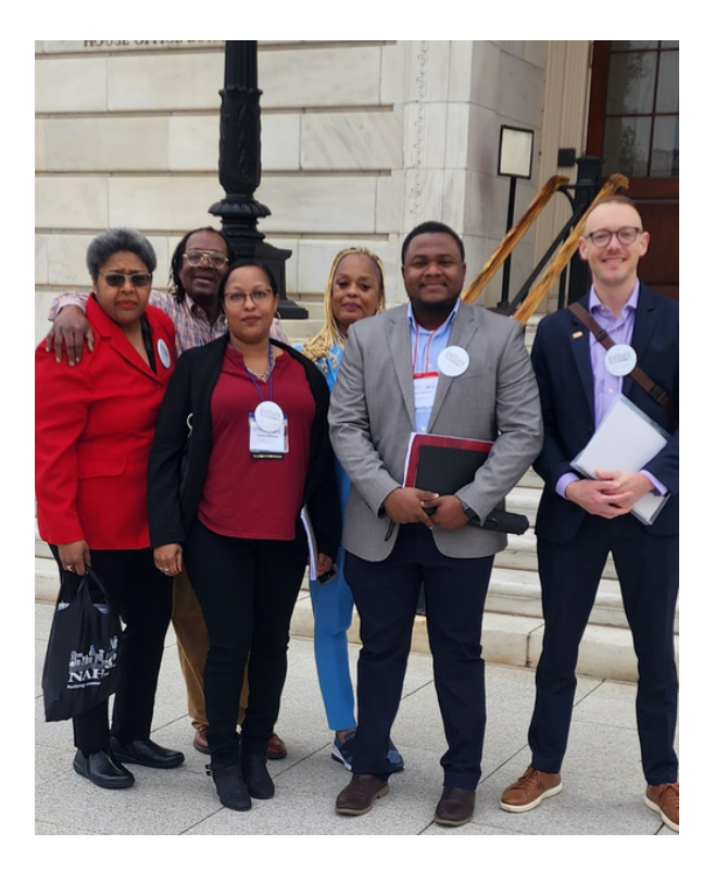
The Ypsilanti Housing Commission Board of Commissioners and YHC staff at Capitol Hill.

The YHC took full advantage of this opportunity as we met with the offices of U.S. Representative Debbie Dingell, U.S. Senator Debbie Stabenow, and U.S. Senator Gary Peters. Not only did we discuss the support we need on a national level, but we discussed issues that are directly tied to YHC communities. We advocated for resources that would allow FEP to provide additional supportive services to our residents, and we also asked for support in the YHCs efforts at combating community violence.